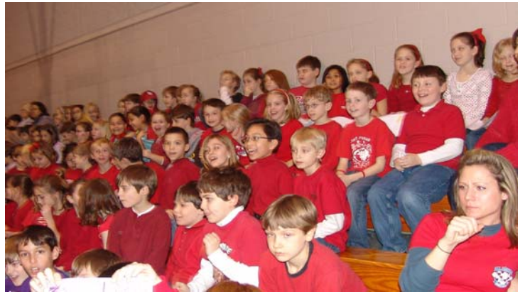
7th & 8th Grade Volleyball Game